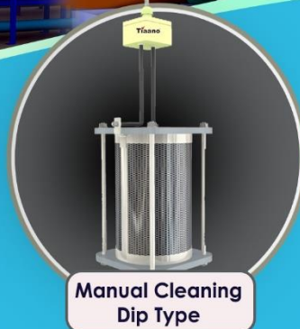
Manual Cleaning Dip Type