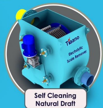
Self Cleaning Natural Draft