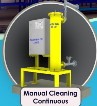
Manual Cleaning Continuous